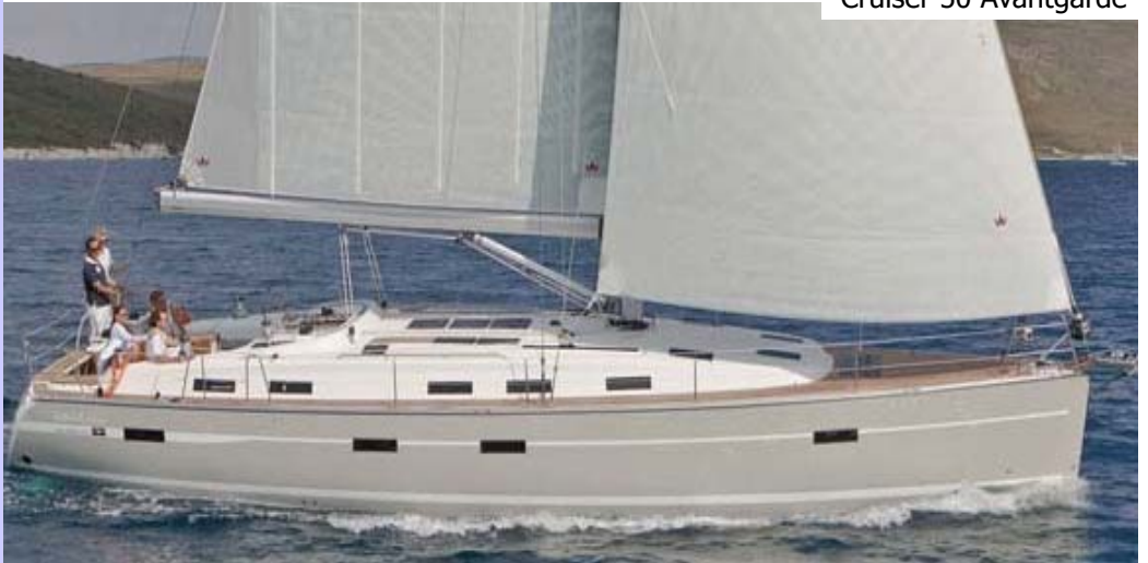
Cruiser 50 Avantgarde

Bavaria has just this week announced that they are now offering for a limited period of time the Cruiser 32, 36, 40, 45 and 50 as the very popular Avantgarde model. Essentially for a little over the basic model price you receive a whole load of extras, including the hull being that beautiful silk grey rather than the standard white, the high-tech sails with mainsail furling, electronic and multi-media packages, a bow thruster ... again give us a call and we can give you the full details. It really is a very attractive package.