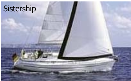
Bavaria 38, 2004, just listed, with a new engine, rigging etc., $198,000