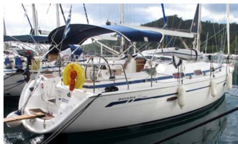
Bavaria 42, 2005, well priced in the Med, $220,000